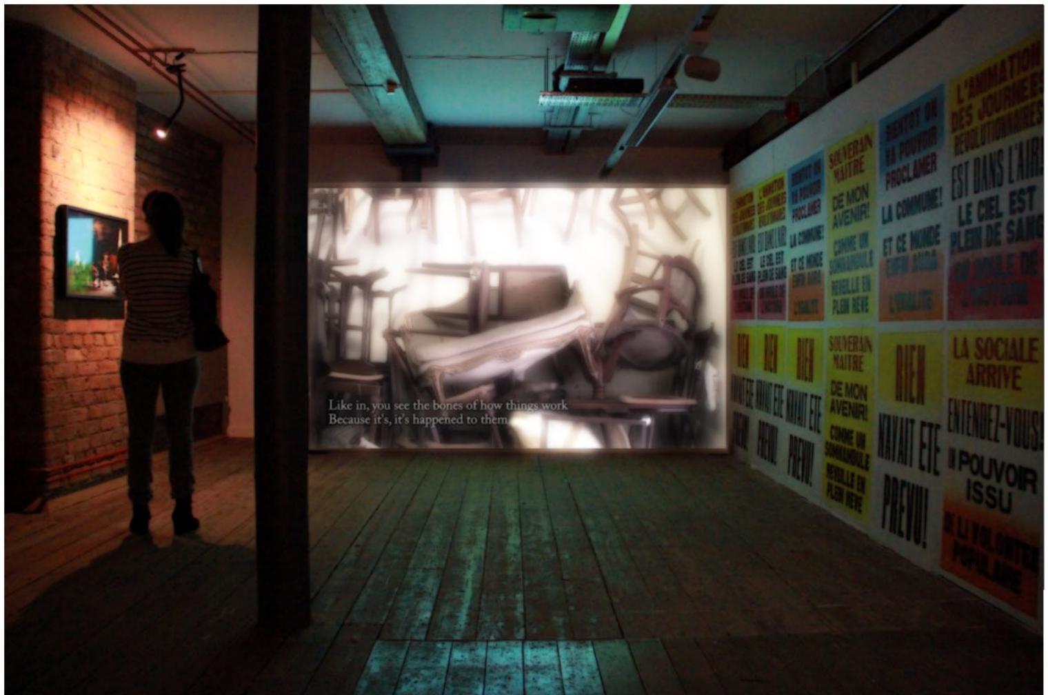
La Comuna Installation: video (HD), posterwall, framed photo

Framed photo from workshop at occupied factory (top), and installation view (above)